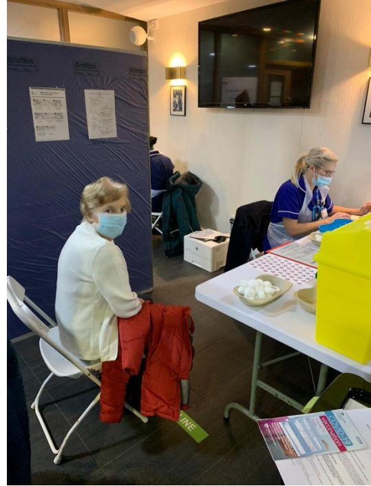
Over the weekend, a local Facebook page group received positive comments regarding the vaccination rollout in Swadlincote.